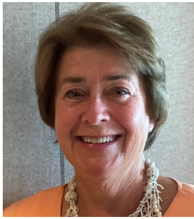
Sydney Pool Fundraising Chair